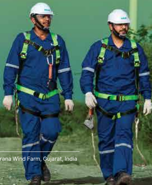
Nakhatrana Wind Farm, Gujarat, India